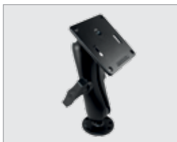
Ball joint mount