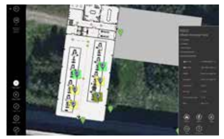
Augmented reality software makes business processes transparent and mobile data management easy to handle.