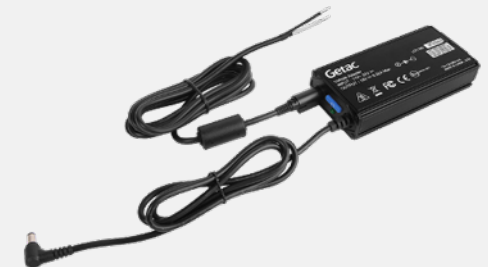
Bare Wire Version