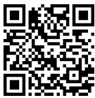
B360 3D demo